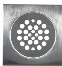
Round drain plate & trim ring kit