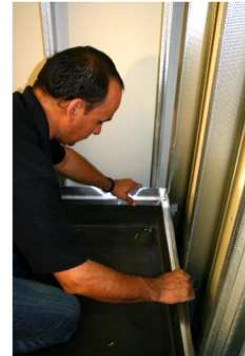
water proof flashing kit