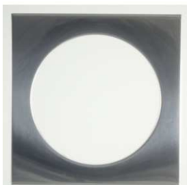
Drain trim ring

Redi Drain is the Tile Redi solution for enabling the shower to have designer drain plates for the shower drain so that the shower drain plate can match the plumbing hardware in the shower and the bathroom.